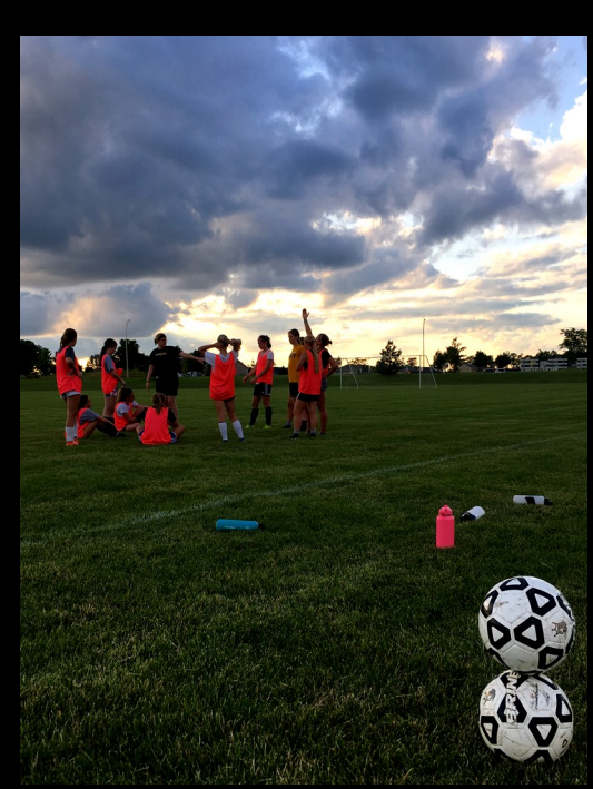
July 6-9th, 2020